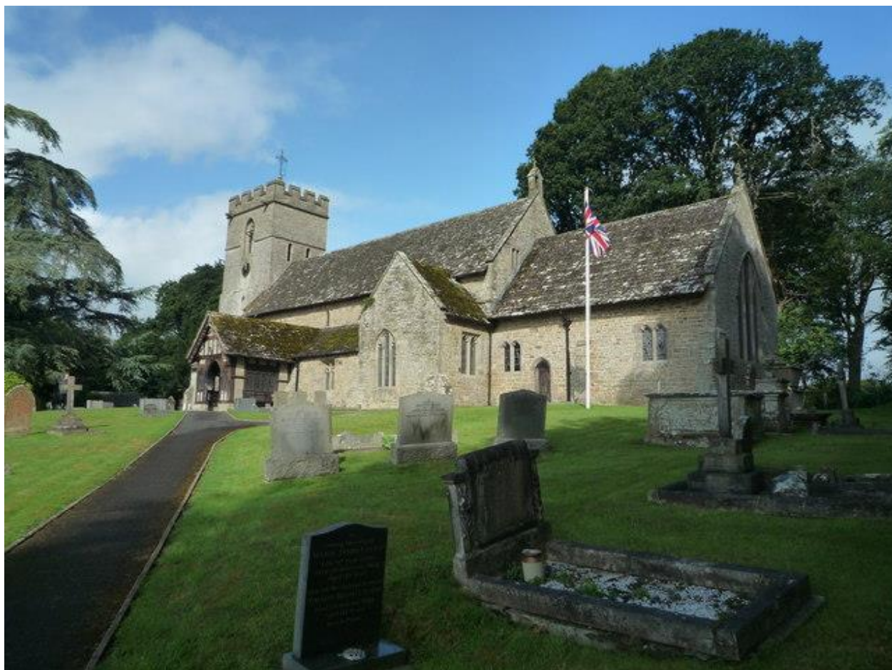
St. Michael & All Angels Church, Lyonshall