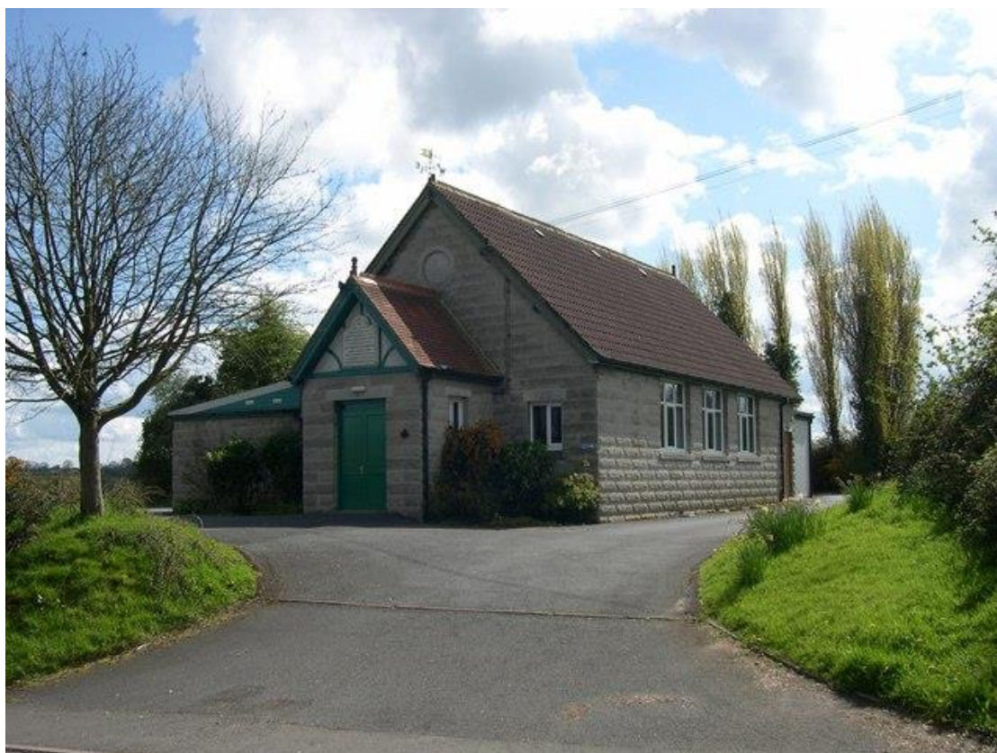
Lyonshall War Memorial Hall